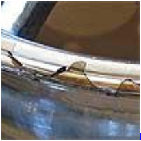
Damage by improper tire mounting or improper tire mounting technique.

Damage by improper tire mounting or improper tire mounting technique