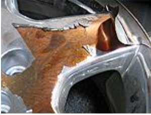
Delamination / Separation

RimGuard Xtreme limited warranty covers ONLY delamination / separation of the plating from the front face and front lip of the wheel or related accessory, caused by a manufacturing defect, not caused by impact, road hazard, chemical damage or improper installation technique. The example shown below is an example of a delamination / separation caused by a manufacturing defect.