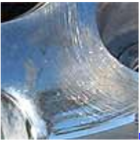
Finish damaged through improper cleaning.

(Must use proper methods to clean the wheels. This is an example of steel wool used on chrome finish. See our care and maintenance section for cleaning tips and techniques.)