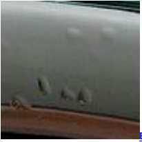
Blisters in Chrome Plating.

(Caused by outgassing of trapped silica in the base substrate material.)