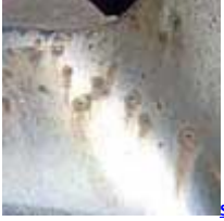
Surface Corrosion "Rust"

(Not covered but can be prevented through proper maintenance.)