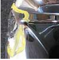
Accident / Road Hazard / Curb Damage.

(Curb damage, road hazards, debris impacting wheels etc.)