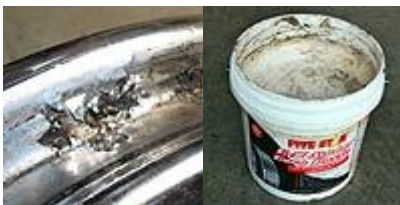
Damage to bead seat area from the use of incorrect tire lubricant when installing tires

(Only waterless wax based tire mounting solution should be used)