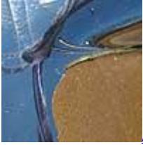
Alteration or modification.

(Including damage caused by razor blades and masking tapes, in painting on top of chrome plating.)