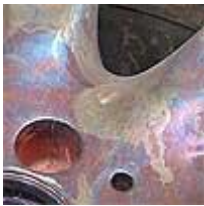
Corrosion due to chemicals

(Harsh wheel cleaners / polishes such as car wash wheel cleaners which can streak or change the color of the finish)