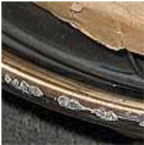
Finish / wheels damaged in transit.

(Retain all packaging materials and contact your courier or freight carrier.)